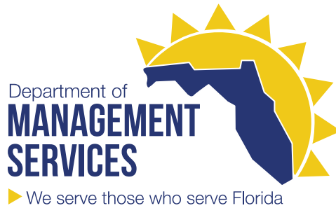
Exhibit B ADDITIONAL SPECIAL CONTRACT CONDITIONS

A. Special Contract Conditions revisions: the corresponding subsections of the Special Contract Conditions referenced below are replaced in their entirety with the following: