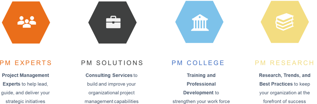
Figure 2 – PM Solutions’ Overview

Our commitment to quality also includes executive oversight on every engagement and unparalleled attentiveness to the relationship we forge with each of our clients.