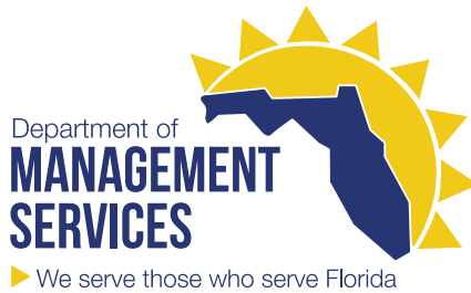
Exhibit A Scope of Work