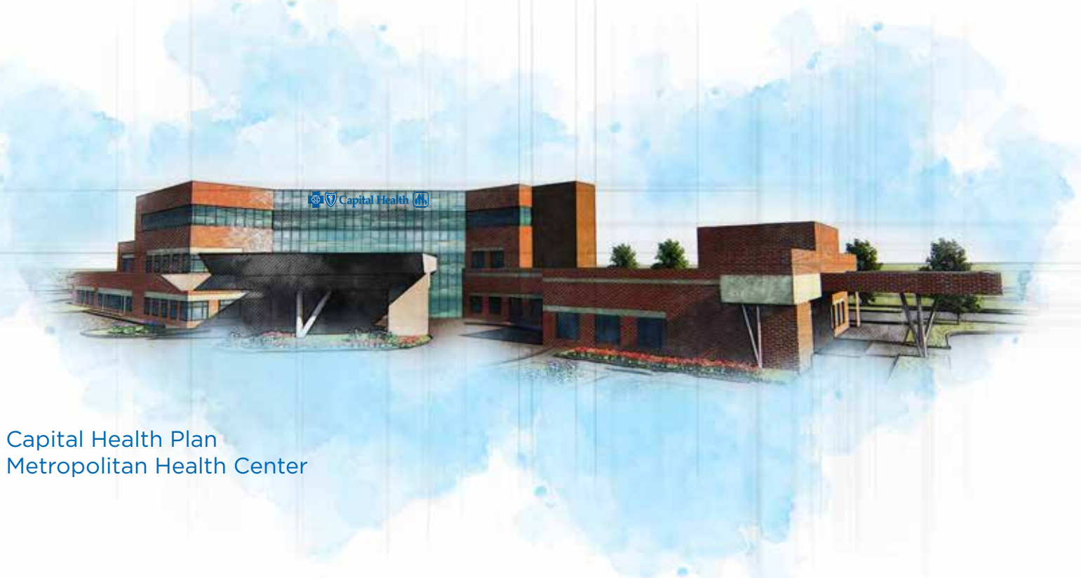
Capital Health Plan Metropolitan Health Center

This 24-hour resource is staffed by health care professionals who can assist members with their health-related questions by calling 850.383.3400.